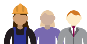
Local Communities, Industry and Business Groups