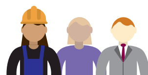
Local Communities, Industry and Business Groups