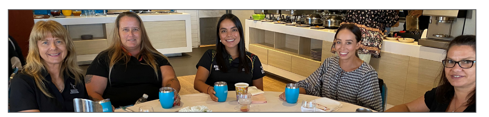
July 2020 to March 2021

Small local businesses 301 approved with LBP