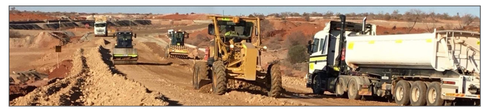
July - December, 2020

Small local businesses 86 approved with LBP