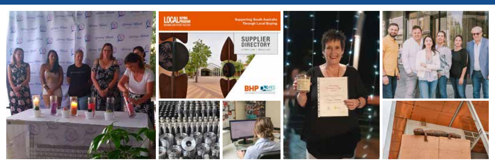
For more information on the Local Buying Program, please visit www.localbuying.com.au